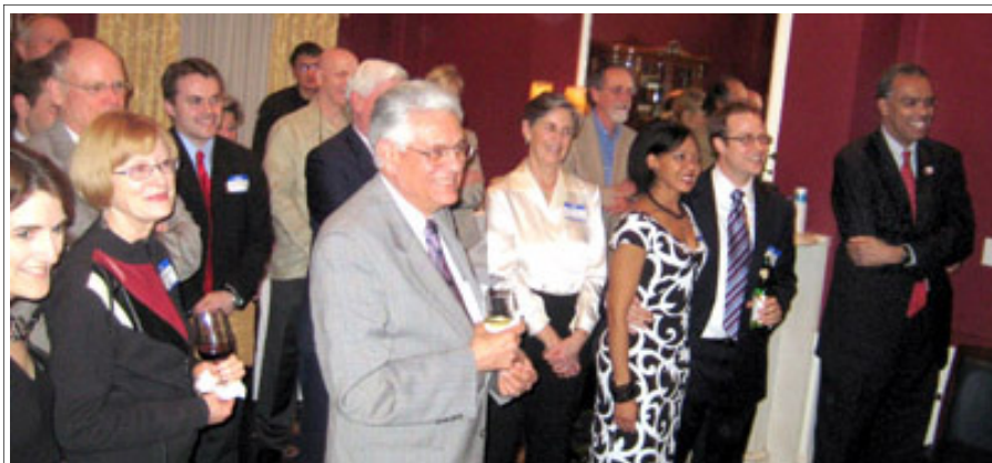
Audience at the Gala

The event was held at the Stewart Mott House in Washington, D.C. It celebrated Fondo Q's scholarship and grant program for low-income Dominicans & FDR's Community Challenge Fund and Program Support Fund.