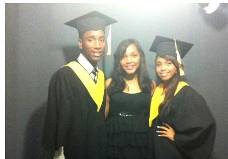
Photo from a Fondo Quisqueya success story. Read below to learn more!