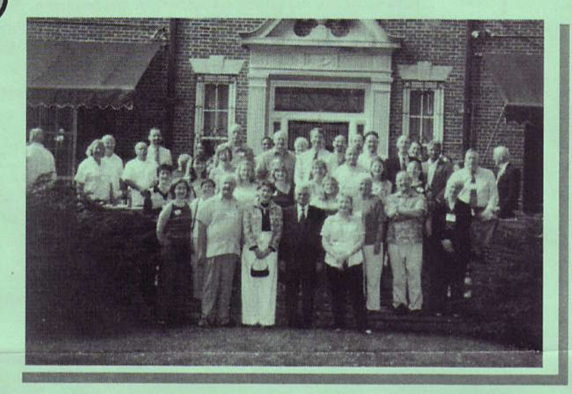
What is a P.C. event without a group photo?

We continue to fund scholarships for low-income Dominicans for technical vocational courses, and we support workshops and other educational activities.