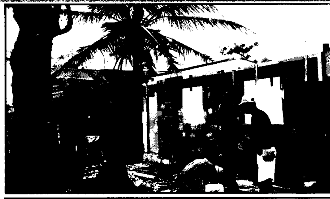
Residents of the community are rebuilding the school in Batey Altogracia.

Reforestation: With the assistance of the District Supervisor for Community Affairs, officials of the local forestry office have agreed to supply saplings of indigenous trees and give lectures on their planting and care. The individual school communities will be invited to the lectures and plantings will be in both the school yards and communities. Future involvement of Environmental Education PCV's will enhance this program. School Vegetable Gardens: Gardens are currently being planted with seeds provided by the Peace Corps. As plantings