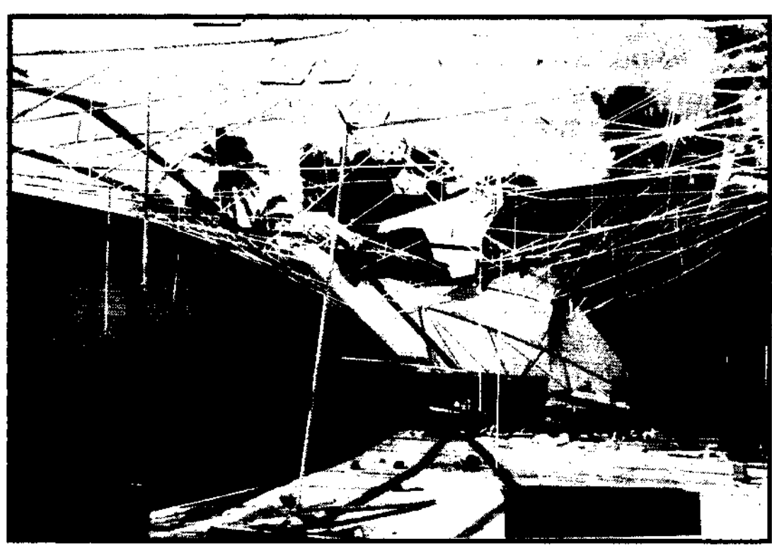
This is but one example of hurricane damage to a school in Los Ranchos.

organized a reconstruction pilot program with three main goals: (1) repair the physical building so that the classes could recommence as soon as possible; (2) raise the self-esteem of the community involved by establishing the school as a symbol of normality, security, and hope in the midst of such widespread damage, and (3) strengthen the community involved by integrating the people in the actual