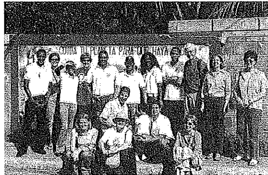
Members of the Brigada Verde joined by Members of the Boards of Directors from Fondo Q and FDR and FQ local committee members