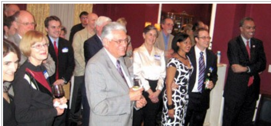
Audience at the Gala

The event was held at the Stewart Mott House in Washington, D.C. It celebrated Fondo Q's scholarship and grant program for low-income Dominicans & FDR's Community Challenge Fund and Program Support Fund.