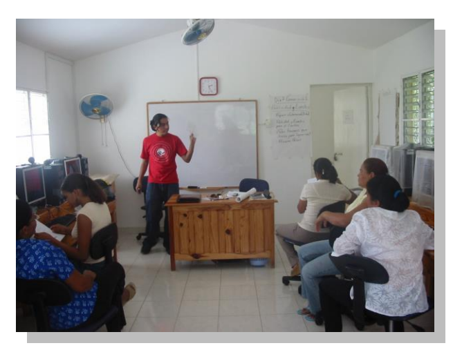
Comunidad de Aminilla (Computer Training)

Grantee: Centros de Computos y Comunicación de la Comunidad, FUDECO-VERIZON