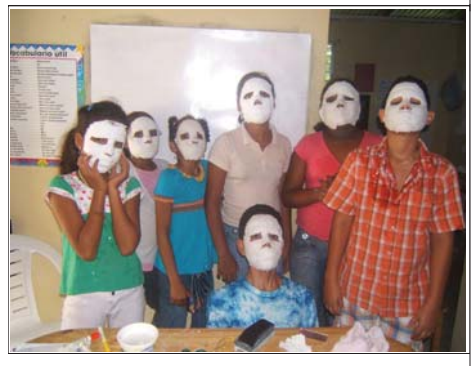
Art Class for Children in San Victor, Moca

Funds from Fondo Quisqueya were used to support an art, crafts, and creativity course for approximately 20 underprivileged kids, ages 3 to 12, in San Victor, Moca. The 6month course gave the group of disadvantaged youth the opportunity to learn through art. The kids were able to express themselves using art as a creative outlet, which helped to improve some behavioral problems. Many of the kids involved in the program had had no exposure to arts, crafts, or other creative things before the course. For some kids, it was the first time that they used crayons to draw a picture. Many of the children experienced art anxiety at the beginning of the course, but by the end, all of the children were working independently to express themselves creatively.