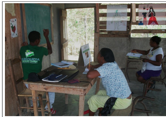
Reading and Writing Classes in Mabrigida, San Juan