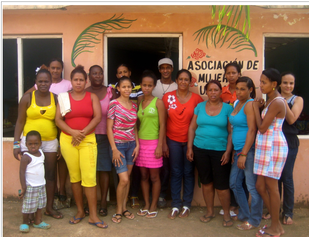
Asociación de Mujeres Unidas, Los Tocones, Samaná